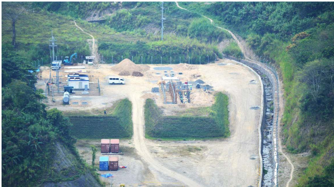
Image 10: Processing Plant switch yard and back –up power construction activities

The establishment of the processing plant switch yard and backup power generation facilities has also commenced.