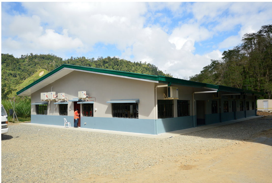
Image 3. Mine Office Complex