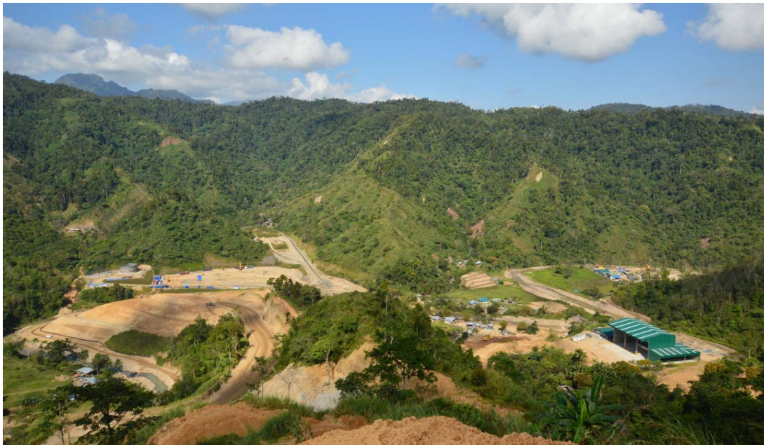
Image 1. Site panorama showing process plant pad (centre rear), heavy vehicle workshop and mine office (front right) and main office complex (right centre)

The program of on-site infrastructure works is now largely complete and has been commissioned in support of the gold processing plant and residual storage impoundment construction activities. Key components recently completed include a heavy vehicle workshop, mine office complex, aggregate crushing plant and general warehouse.