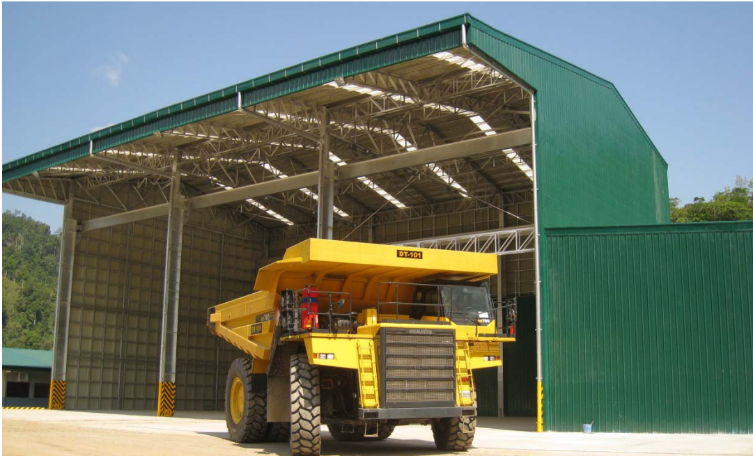
Image 2. Heavy vehicle workshop