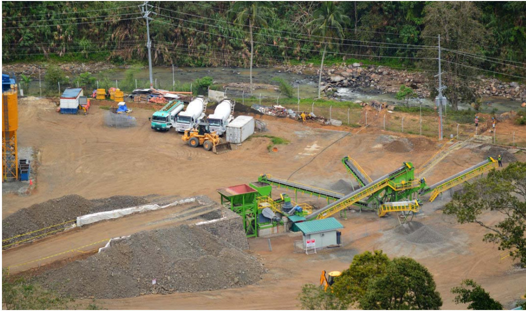
Image 4. Aggregate crushing plant

The site is now fully operational in support of the intensive construction efforts in the processing plant and residual storage impoundment areas.