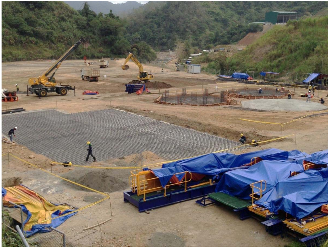
Image 9: Civil works, showing neutralisation pad (foreground), CCD pad (centre right) and preparations for the BIOX pad (background)

The establishment of the processing plant switch yard and backup power generation facilities has also commenced.