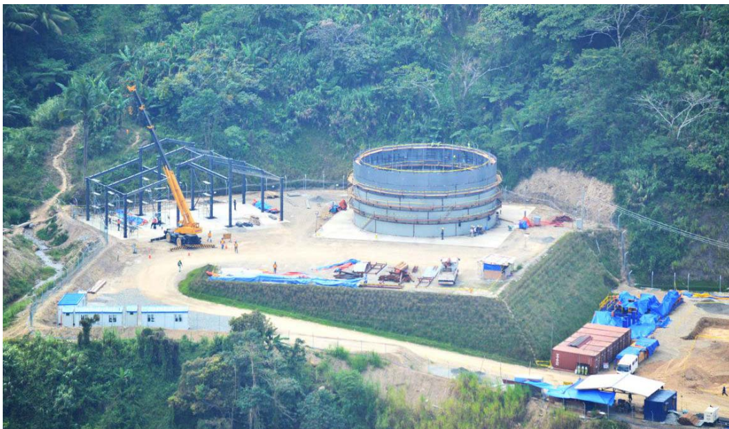
Image 8: Process Plant construction activities showing return water tank and workshop building

Civil, tank and structural, mechanical and piping packages have been tendered and awarded. The civil and one of the tank contractors have mobilised to site and commenced construction activities.