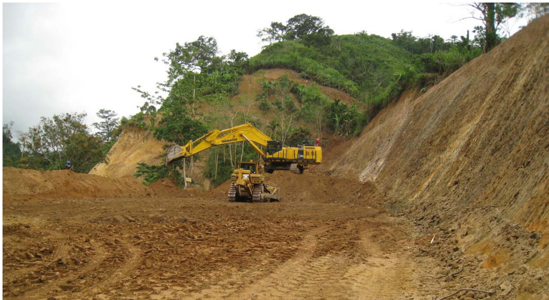
Image 11: Haul road development into the Residual Storage Impoundment site

A tree cutting permit has now been issued for the RSI construction allowing full development activities to be initiated. Road access to support the use of the Company's Komatsu fleet in the construction of the RSI wall activities are in progress and tree cutting and clearing activities are underway.