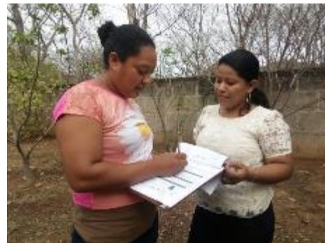
Illustration 25: Registration of members to the Agua Es Vida program.