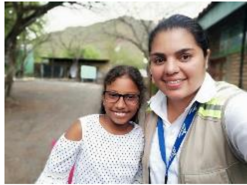
Illustration 1614: Donation of 50% of the cost of the glasses to the beneficiary of Santa Cruz de la India.