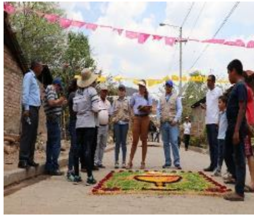
Illustration 27: First contest of sawdust carpets in Santa Cruz de la India.