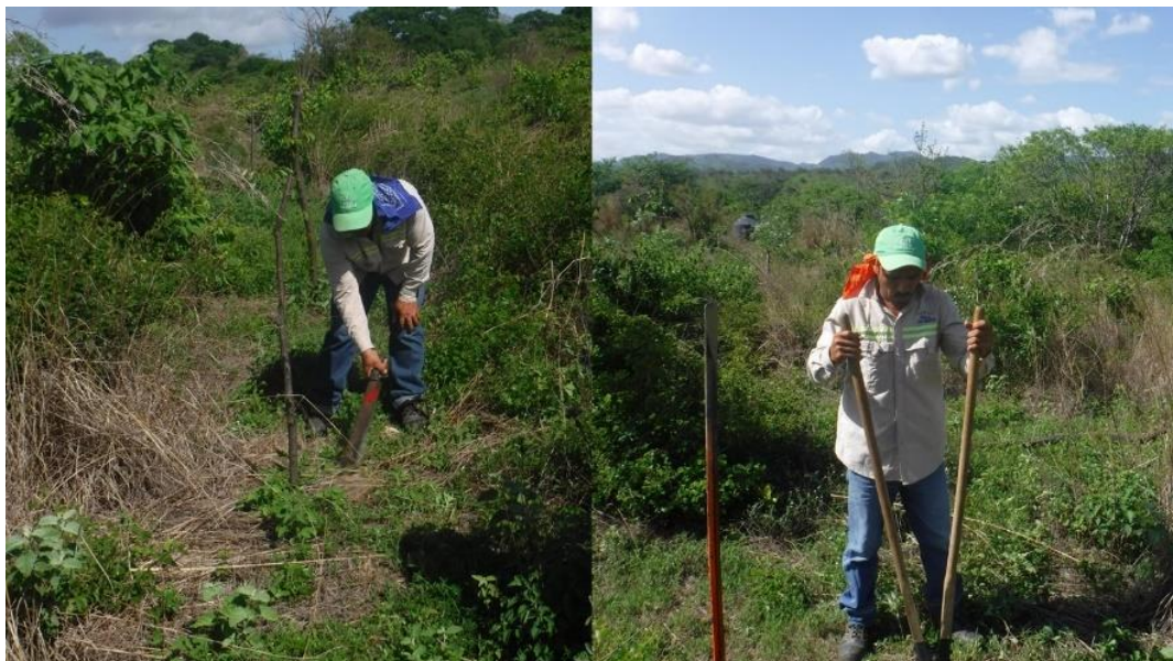
Photograph 3.3.3.1. (b) Maintenance and preparation for reforestation activities in Espinito-Mendoza concession.

A reforestation activity with coworkers will be done on 3 rd July to celebrate Miner's Day and the National Tree Day.