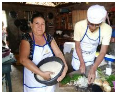
Illustration 181: Basic cooking course.