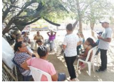
Illustration 3521: Health Circle, talk about arthritis.