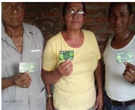
Illustration 30: Opening of savings accounts in the bank, savings program for members of the business program.