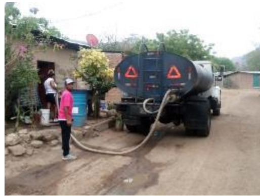
Illustration 163: Delivery of water to homes in Santa Cruz de la India