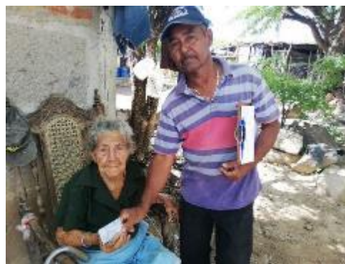
Illustration 203: Delivery of identity cards to people over 65 years of age.