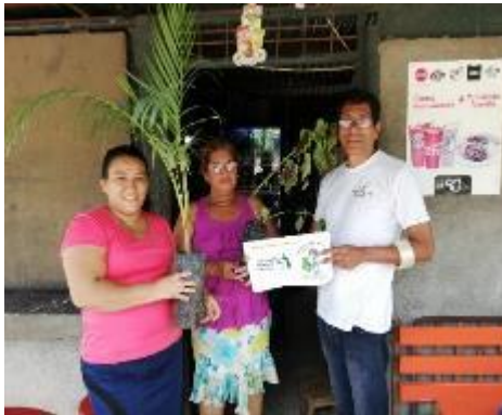
Illustration 29: Exchange of plants for plastic bottles with business owners.