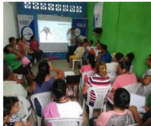
Illustration 17: Workshop on the importance of money saving with program members.