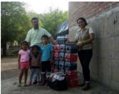
Illustration4: Donation of refreshments at religious celebration, Los Rastrojos.