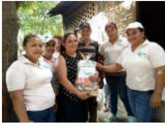
Illustration8: Delivery of packages to people with disabilities.