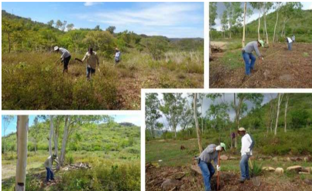
Photograph 3.2.2.c. Conditioning of reforestation area in ALFA 6, La India concession

An area in ALFA 6 (a location of the company) is being prepared to plant 140 trees in compensation for 14 trees cut down in the camp area due to remodeling of the parking lot, as agreed with National Forestry Institute (INAFOR).