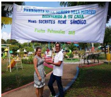
Illustration17: Delivery of offering to the Bishop of León.