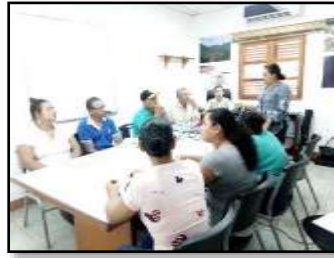
Illustration9: Water Law Training