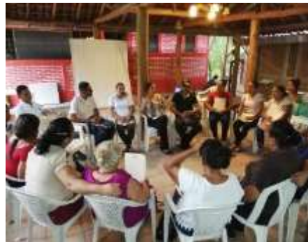
Illustration15: Training on transversal competencies for leaders.