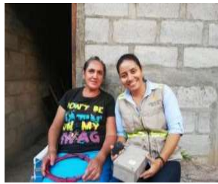
Illustration3: Donation of electrical materials, Santa Cruz de la India.