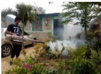
Illustration10: Fumigation day.