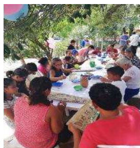
Illustration22: Grandfather's Day celebration with program members.