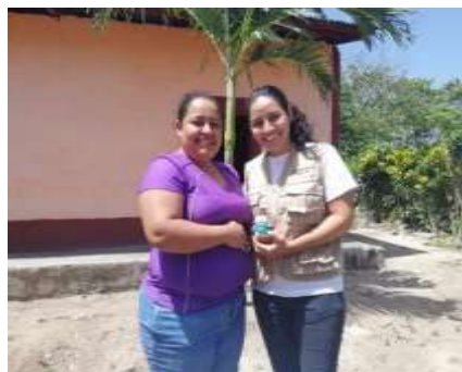
Illustration6: Donation of medicine, Santa Cruz de la India.