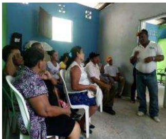
Illustration13: Informational meeting with members of the program.