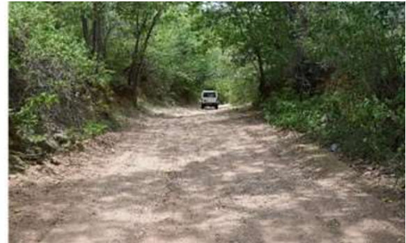
Left. Example of critical point Right. Same critical area after improvement