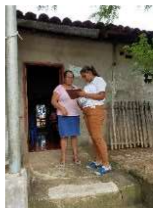
Illustration 7: Filling receipt to beneficiary of the program in Santa Cruz de la India..