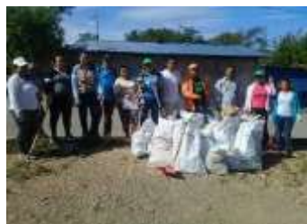
Illustration11: Cleaning day in the village.