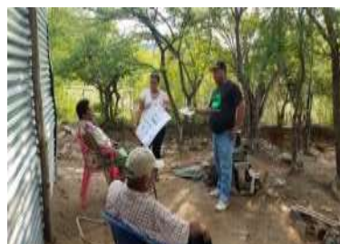
Illustration12: Awareness campaign on solid waste management.