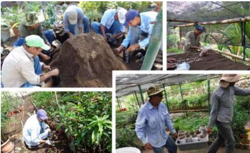
Photograph 3.2.2.a. Tree nursery work

The tree nursery “Oro Verde” provides the trees for all reforestation areas in the Condor concessions. Maintenance of the tree nursery continued, which includes watering, fertilizing and weed control.