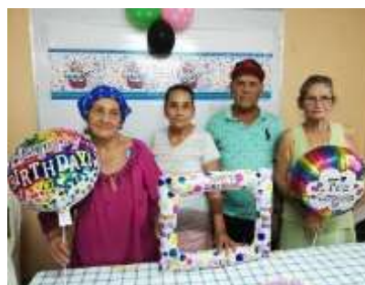
Illustration25: Birthday celebration of the quarter.