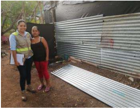
Illustration2: Tin sheet donation Santa Cruz de la India.