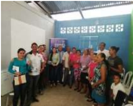
Illustration14: Workshop on energy efficiency.