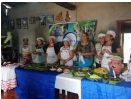
Illustration19: Display typical buffet Caballo Bayo.