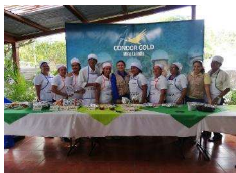
Illustration18: Promotion of cooking students.