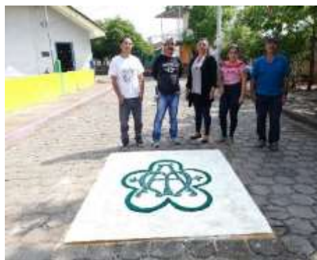
Illustration16: Production of sawdust carpets in the celebration Mercees Virgin in El Jicaral.