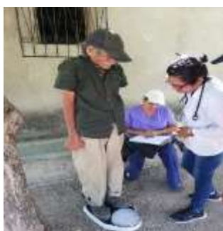
Illustration20: Physiotherapist visit.