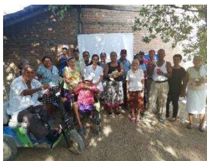
Illustration24: Health circle.