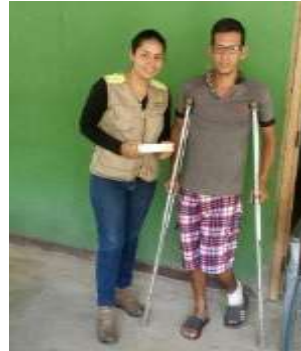
Illustration1: Donation of medicines, Agua Fría.