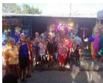
Illustration23: 1st anniversary of the piñatas project.