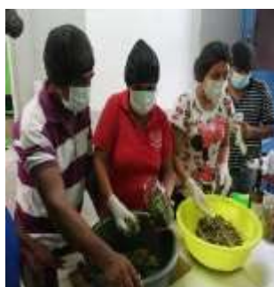
Illustration21: Preparation of tinctures by members of the medicinal garden.