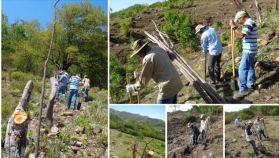
Photograph 3.2.2.b. Reforestation area in Nance Dulce village within the La India concession

228 new seedlings of Ceiba pentandra outed sprung in the tree nursery and 250 trees were transferred to the tree nursery and donated by INAFOR to be taken care and ensure their survival.