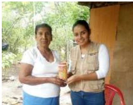
Illustration5: Donation of medicine, El Bordo.