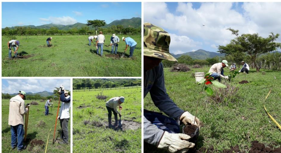
Photograph 3.2.3.3.a Reforestation in new area in Soledad de la Cruz village.

In October, an agreement was signed to ensure the 2.9 ha for the compensation plan of Real de la Cruz concession. Conditioning of the area began and a total of 237 trees were planted.