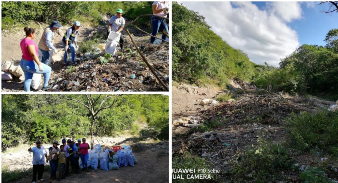
Photograph 3.2.1.2.a. Cleaning campaign in support of the social team.

Support was provided to the Agua es Vida social program in the cleaning campaign and the construction of metallic containers for their waste management program in La India. The cleaning campaign collected a total of 40 bags, from which 15 bags were plastic bottles and 25 bags were general waste. Also, a workshop on reuse of plastic bottles was done with the Elderly program.