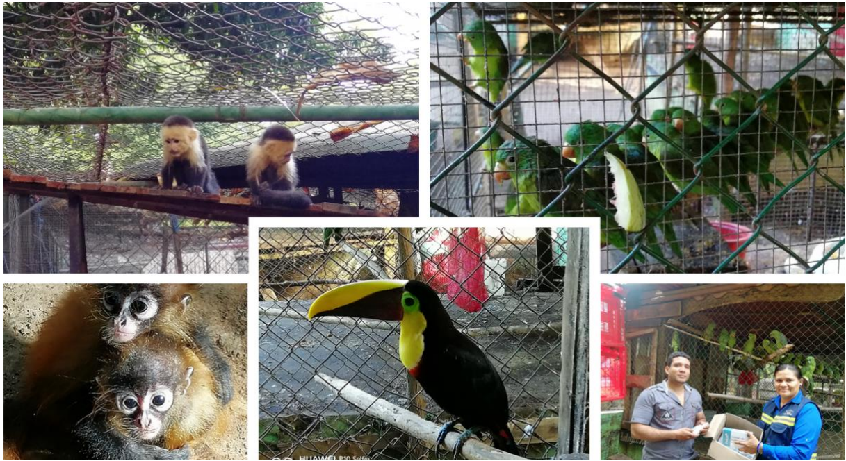
Photograph 3.2.1.3.a. Animals rescued from illegal exportation located temporarily in the León Zoo.