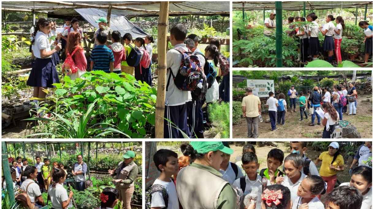
Photograph 3.2.2.b. Talk with school kids about trees and plants in the tree nursery “Oro Verde”

As part of the collaboration with the social team, support was given in the contest “Identifying the native plants from my community” organized within local schools, which included a site visit to the tree nursery, a workshop on existing plants and teaching how to identify them.