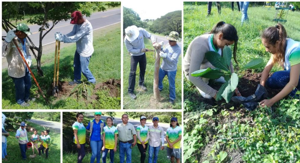
Photograph 3.2.3.1.b. Reforestation activity with “Jóvenes en Acción” group from the social programs

As part of the collaboration with the social team, a reforestation activity was carried out with the new group “Jóvenes en Acción” and Condor’s employees. A total of 22 participants and 46 trees were planted next to the NI-26 highway, in La India concession. In October, a total 523 trees were planted in La India concession.