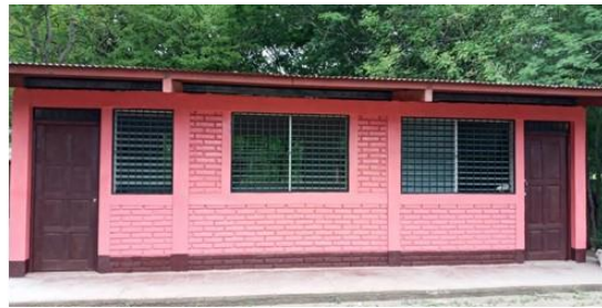
Before and after remodeling