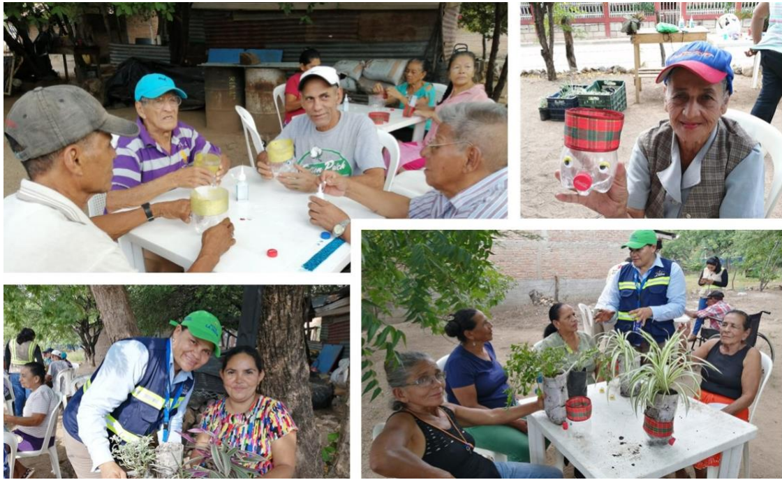
Photograph 3.2.1.2.b. Workshop on recycling and reuse with members of the social programs.

This quarter, a total of 720 lb of the recycled materials were delivered to Los Pipitos recycling program, along with 170 lb of paper and cardboard and 550 lb of plastic gathered internally and from the villages and artisanal miner's areas.