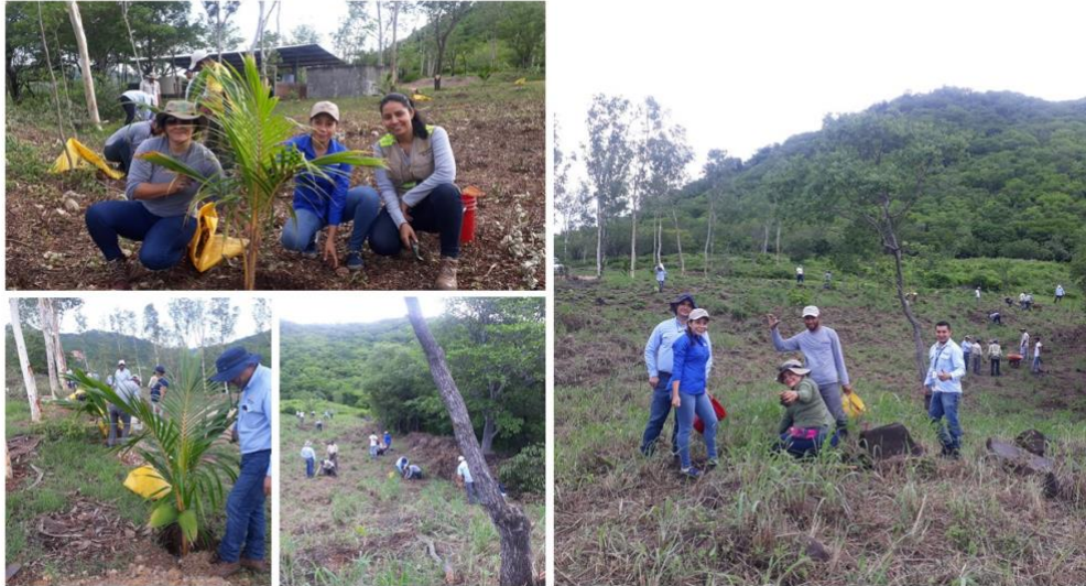
Photograph 3.2.3.1.a. Reforestation activity in ALFA 6 with coworkers.

As part of the collaboration with the social team, a reforestation activity was carried out with the new group “Jóvenes en Acción” and Condor’s employees. A total of 22 participants and 46 trees were planted next to the NI-26 highway, in La India concession. In October, a total 523 trees were planted in La India concession.