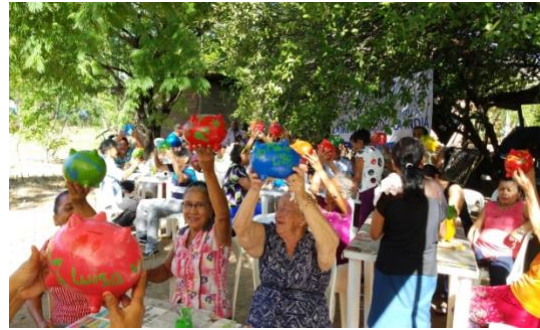
Picture 24: Senior's Day Celebration