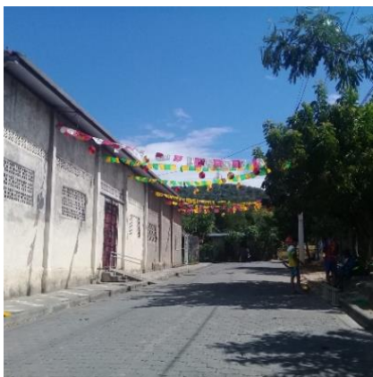
Picture 19: Development and placement of Christmas arrangements in the community