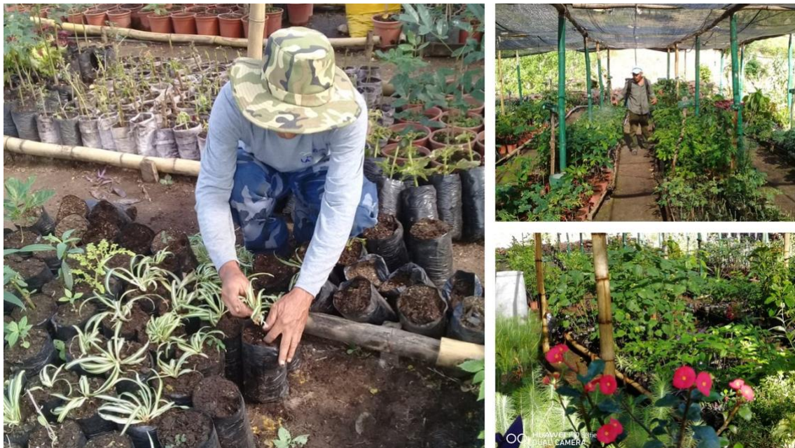
Photograph 3.2.2.a. Tree nursery work

The tree nursery “Oro Verde” provides the trees for all reforestation areas in the Condor concessions. Maintenance of the tree nursery continued, which includes watering, fertilizing and weed control as well as production of new seedlings.