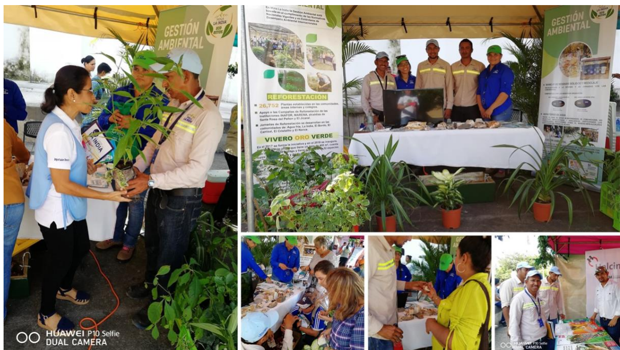
Photograph 3.2.1.1.a. Participation on the Environmental Fair organized by MARENA-León

In November, the environmental area participated in the Environmental Fair “ Rugidos de la Naturaleza” organized by the government institution MARENA-León in León city. In December, environmental area participated in the Forestry Fair organized by the government institution INAFOR in Managua. The participation included a stand, showing the environmental activities that the company develops, with donations of plants and display of rocks located in the concessions.