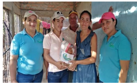
Picture 14: Delivery of products to people with disabilities, India.