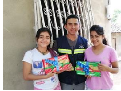
Picture 22: Delivery of Christmas details to young people enrolled in the program.