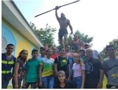
Picture 21: Museum tour: Pre-Columbian Museum of Chagütillo, archeology and history museum of Sébaco and the Rubén Darío House Museum in Darío city.