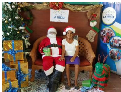
Picture 7: End of the year in Agua Fria, photographs with Santa Claus